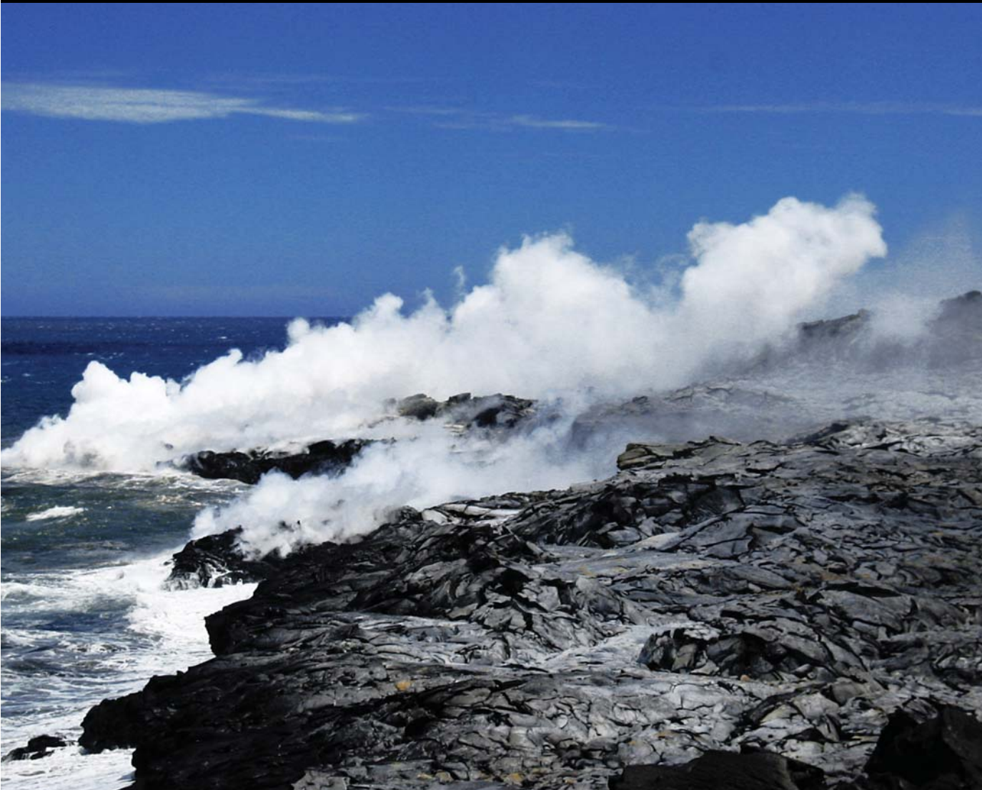
Kilauea Lava Flow ( East Rift Zone, Hawaii )