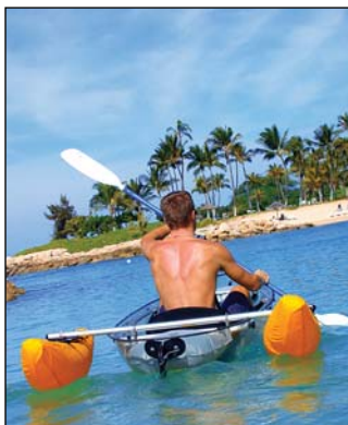
Makawei Outrigger System

The Clear Blue Hawaii Makawei Outrigger System is a new breed of light weight, compact stabilizing system. Makawei sports an impressive space efficiency for increased versatility ensuring you never have to limit yourself due to space concerns again. Avoid the pitfalls of uncertain weather conditions & human error. The Clear Blue Hawaii Makawei Outrigger System provides safety and security when it matters most. Arrive at your destination in safety & with piece of mind. Clear Blue Hawaii - Devoted to redefining the paddle sports kayaking experience.