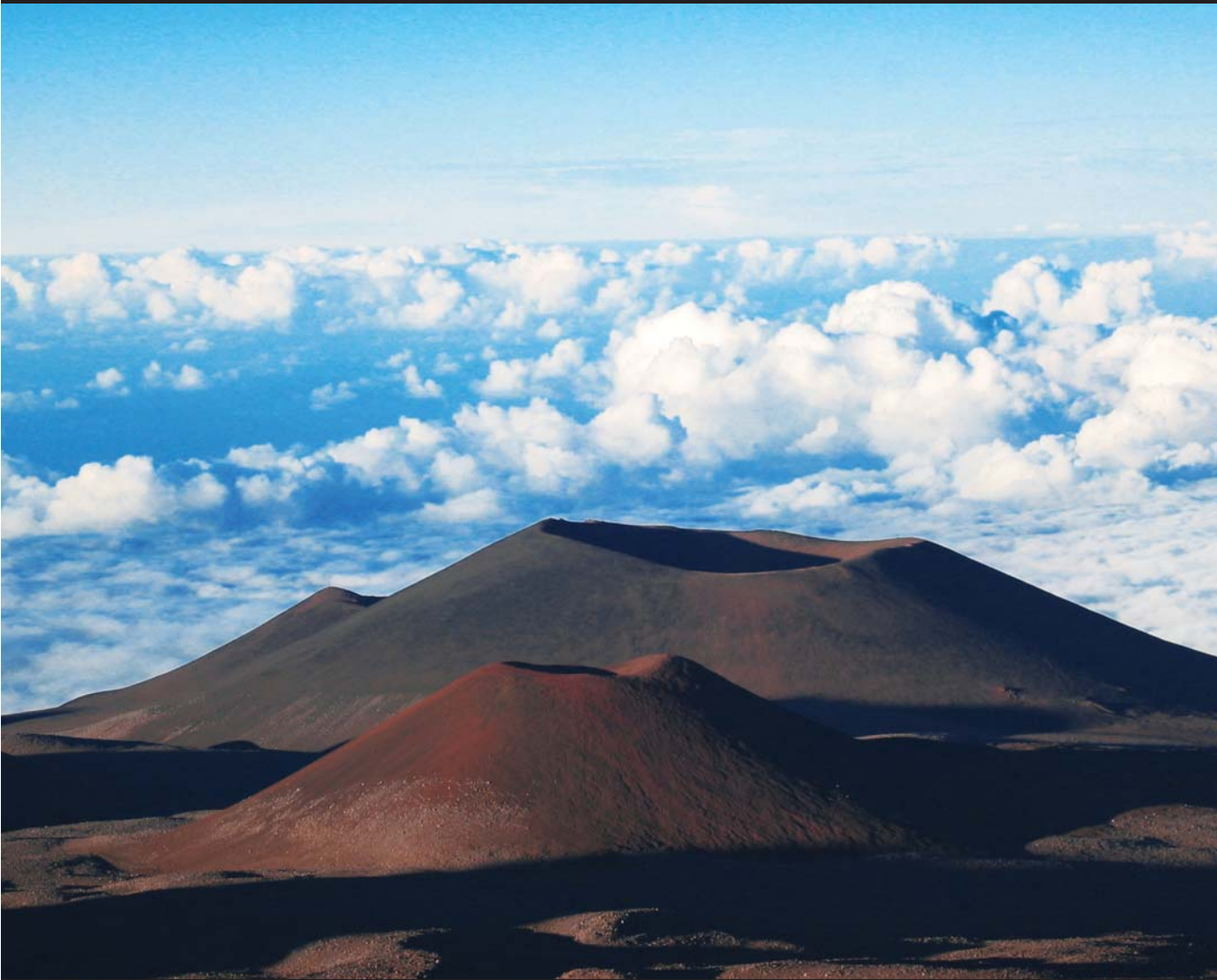
Mauna Kea ( Big Island, Hawaii )